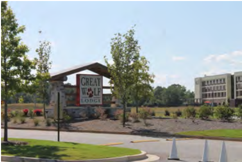
Great Wolf Lodge